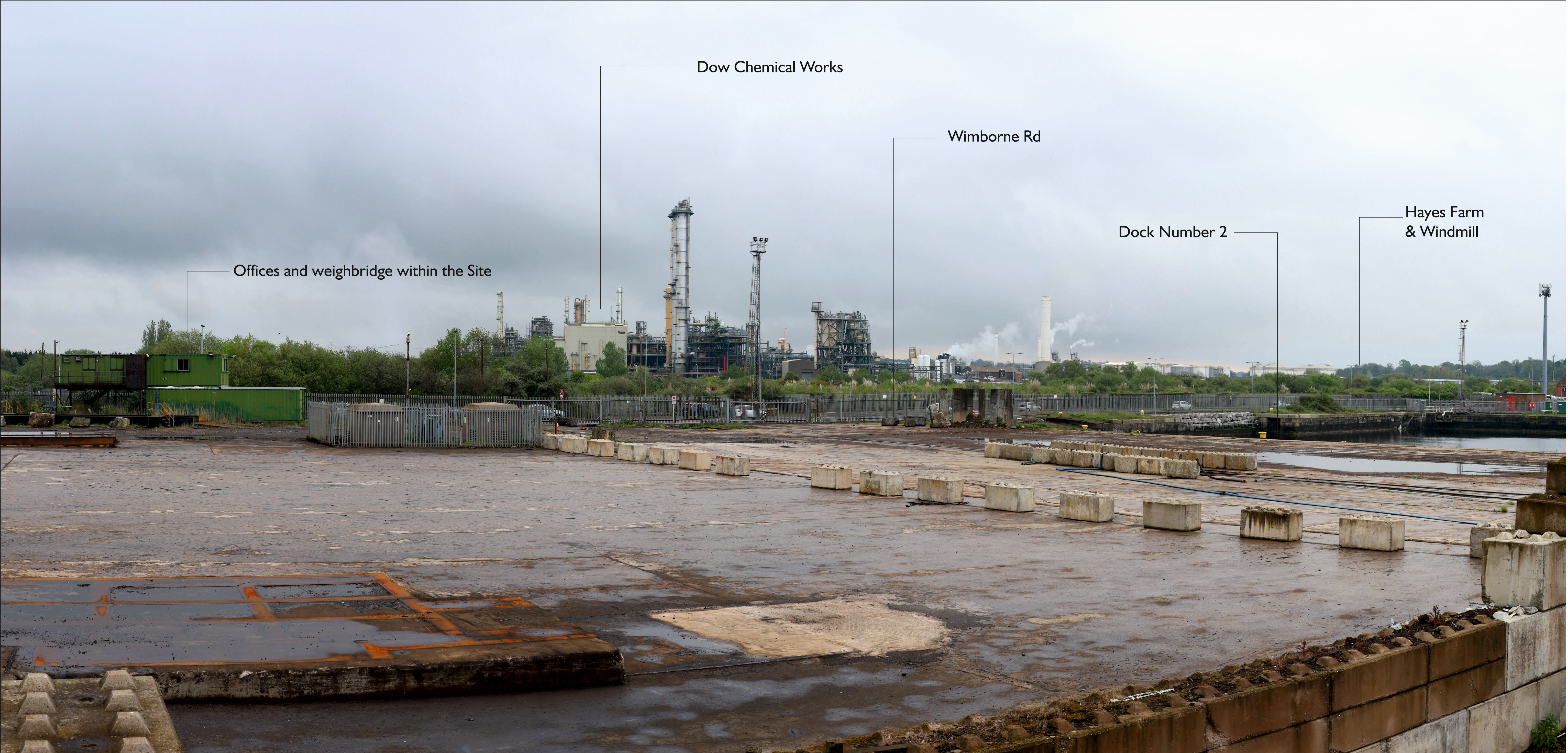
Illustrative Viewpoint 3b - Looking northeast from top of block wall located towards centre of the Site